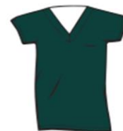
Inpatient Dietitian Hunter Green