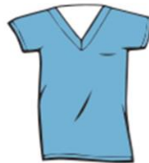
Procedural (Cath, IR, OR, LD) Hospital Provided Ceil Blue