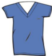
RN Galaxy Blue