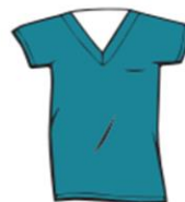
Rehab (PT/OT/SLP) Caribbean Blue