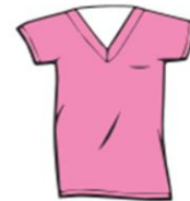
Mammography Shocking Pink