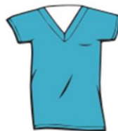
Laboratory Teal Blue