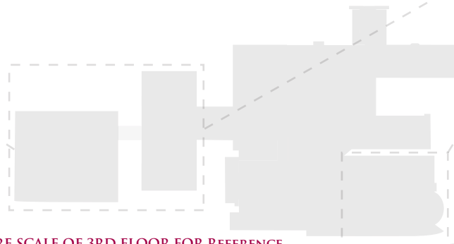
MINIATURE SCALE OF 3RD FLOOR FOR REFERENCE